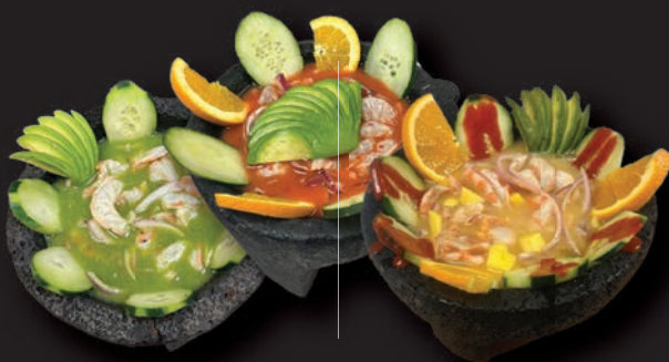
AGUACHILES VERDE, ROJO, MANGO HABANERO $19.99