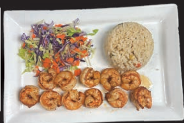
CAMARONES AL MOJO DE AJO Grilled shrimp marinated with garlic. Served rice, mix greens and avocado slices. $18.49