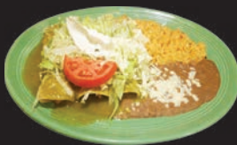
ENCHILADAS VERDES $9.99 Two enchiladas with your choice of beef or chicken topped with green chilli sauce lettuce and sour cream. Served with rice & beans.