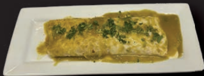
CHILE VERDE BURRITO Burrito filled with pork carnitas, rice and beans. Topped with our green sauce and cheese sauce. $14.99