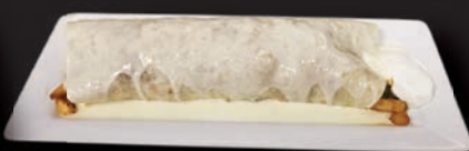
BURRITO MAVERICK Oversize burrito (12" tortilla) filled with steak, grilled chicken and shrimp, with grilled bell peppers, onions, tomatoes, fries and jalapenos, (everything inside) covered with our delicious cheese sauce. $16.99