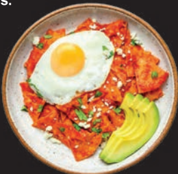
CHILAQUILES $11.99 Fried corn tortilla chips simmered in our special red sauce, topped with pulled chicken, sour cream, queso fresco, and one fried egg, served with rice and beans.