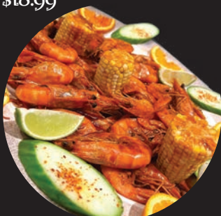
CAMARONES CUCARACHA 12 big grilled shrimps cooked in spicy sauce. Served with corn and cucumbers. 19.99