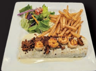
BURRITO CATRIN FILLED with steak, chicken, rice, beans, topped with cheese sauce, chorizo and shrimp. Served with fries and mix greens 17.99