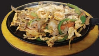
FAJITAS STEAK, CHICKEN OR MIX $11.99

We use our special recipe to cook tender strips of marinated chicken or steak, with sauteed onions, tomatoes & bell peppers. Served with rice & beans, lettuce, sour cream, pico de gallo, guacamole and tortillas.