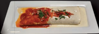
VIKING BURRITO Your choice of steak, grilled chicken or mix, with rice, lettuce, guacamole, sour cream, rice, and beans, everything inside. Topped with red and cheese sauce. $15.49