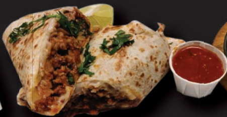
STREET BURRITO A huge burrito filled with steak, chorizo, rice, beans, onions, cilantro, home made house, guac and cheese. $12.99