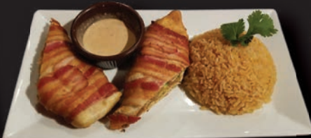
BACON BURRITO Steak, chicken, or mix, with rice, beans, avocado rolled up on bacon, served with rice and chipotle ranch. delicioso!!!! $14.99