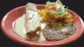
CHIMICHANGA $9.49 We stuff a flour tortilla with your choice of ground beef or chicken, than deep fry to a golden brown and top with queso dip. Served with lettuce, sour cream pico de gallo, Mexican rice and beans.