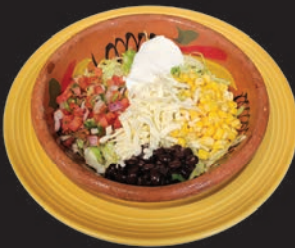
LA CATRINA BOWL Ground beef or chicken $9.99 Steak, grilled chicken or mix $10.99 Shrimp $11.99