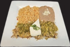
CHILE VERDE CON HUEVOS $10.99 Scrambled eggs mixed with shredded pork topped with green tomatillo sauce, served with rice, beans and tortillas.