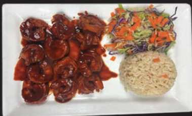
SHRIMP A LA DIABLA SPICY grilled shrimp, served with rice, mix greens and avocado slices. $18.49