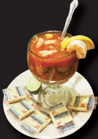
SHRIMP COCKTAIL $16.99 COCKTAIL CAMPECHANO (SHRIMP AND OCTOPUS) $18.99