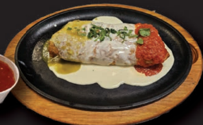
BURRITO FRITO A huge deep-fried burrito filled with steak, chicken, shrimp, pork, chorizo, rice and beans. Topped with cilantro, red, green, and cheese sauce. $18.99