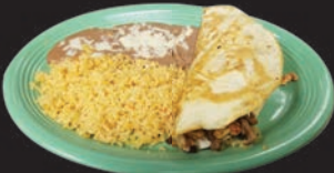
SPECIAL QUESADILLA FAJITA Grilled chicken, beef or mixed with grilled onions, tomatoes & bell peppers. Served with rice & beans. Steak, chicken or mix $9.49 Shrimp $10.49