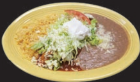
BURRITO SUPREMO $9.99 One large flour tortilla with seasoned ground beef or chicken; topped with lettuce, tomato sour cream, and cheese. Served with rice & beans.