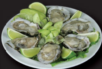
OSTIONES/ OYSTERS 6 ... $14.99 12... $24.99 OSTIONES PREPARADOS $33.99