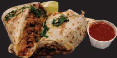
STREET BURRITO A huge burrito filled with steak, chorizo, rice, beans, onions, cilantro, home made house, guac and cheese. $9.99