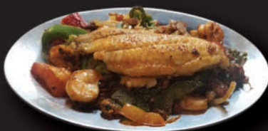
FAJITA DEL MAR Grilled seafood mix, grilled shrimp and tilapia with onions, tomatoes, bell peppers, broccoli, served with rice and beans, lettuce, guacamole, pico de gallo and sour cream $19.49