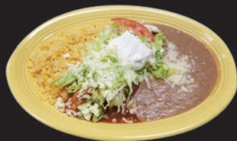
BURRITO SUPREMO Burrito filled with seasoned ground beef or chicken, with rice, beans, lettuce, tomato, cheese & sour cream. $12.99