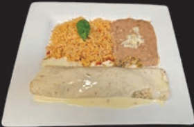
BREAKFAST BURRITO $9.99 Burrito filled with scrambled eggs with chorizo, topped with cheese sauce. Served with rice and beans.