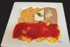
HUEVOS A LA DIABLA $10.99 Two ranch style eggs topped with Mexican sauce, rice, beans, and two flour tortillas.