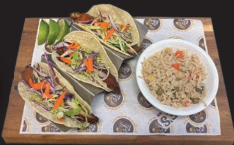
FISH OR SHRIMP TACOS Three tacos with your choice of grilled shrimp or fried tilapia, topped with lettuce, red cabbage, and carrots. Served with white rice and chipotle sauce. $17.99