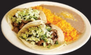
STREET TACO MEAL $10.99 Two street tacos with your choice of meat, topped with onions and cilantro. Served with rice and beans.