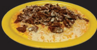
STEAK WITH RICE $10.99 A bed of rice with steak strips, topped with cheese sauce.