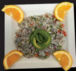
SHRIMP CEVICHE Shrimp cooked on lime juice with chopped onions, tomatoes, jalapeños and cilantro. Topped with avocado and Oranges. $15.99 Octopus o mixto $18.99