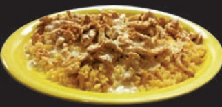
CHICKEN WITH RICE $9.99 A bed of rice with our marinated chicken, topped with cheese sauce.