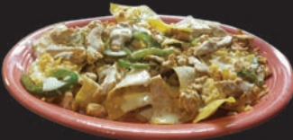
NACHOS FAJITA $10.49 Nachos fajita, chicken or beef grilled with green peppers and onions

We use our special recipe to cook tender strips of marinated chicken or steak, with sauteed onions, tomatoes & bell peppers. Served with rice & beans, lettuce, sour cream, pico de gallo, guacamole and tortillas.