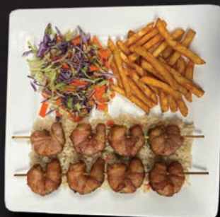
BACON WRAPPED SHRIMP 8 grilled shrimp wrapped in bacon with cheese. Served with white rice and home mix greens. $18.99