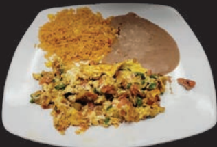
HUEVOS A LA MEXICANA $10.99 Scrambled eggs cooked with pico de gallo, served with rice, beans and tortillas.