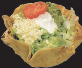
TACO SALAD $8.99 A crispy flour tortilla with melted cheese, sauce, topped with seasoned ground beef or tender chicken, lettuce tomatoes, cheese & sour cream.