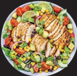
SOUTHWEST SALAD A bed of greens topped with seasoned grilled chicken, black beans, corn, pico, tortilla strips, dry cranberries, served with avocado lime ranch. $10.99