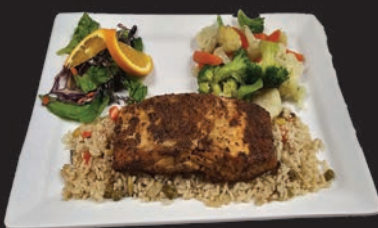
SALMON ASADO Grilled salmon over a bed of white rice, served with mix vegetables, avocado, and home mix greens. $17.25